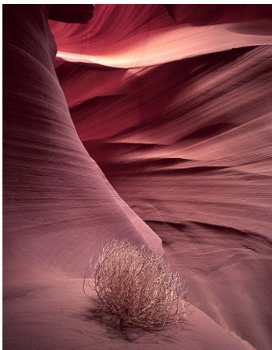
Tumbleweed in Antelope Canyon Ebony SV45te 45 seconds f32 150mm No Filtration

Unknown to me however, my absolute highlight was being saved for our next stop - Page. Here we spent about four hours in Lower Antelope Canyon - for me an almost spiritual experience (a certain M.Fatali prefers to call it "Cathedral Canyon" and rightly says "it invokes wonder, imagination, and reverence"). Yet again Joe and David "booked" us the ideal weather conditions (clear blue skies) and we arrived at the perfect time of day (mid morning). These normally to be avoided conditions are spot on for Antelope. It allows the receding, reflected light to weave its magic around the swirling shapes of Navajo Sandstone.