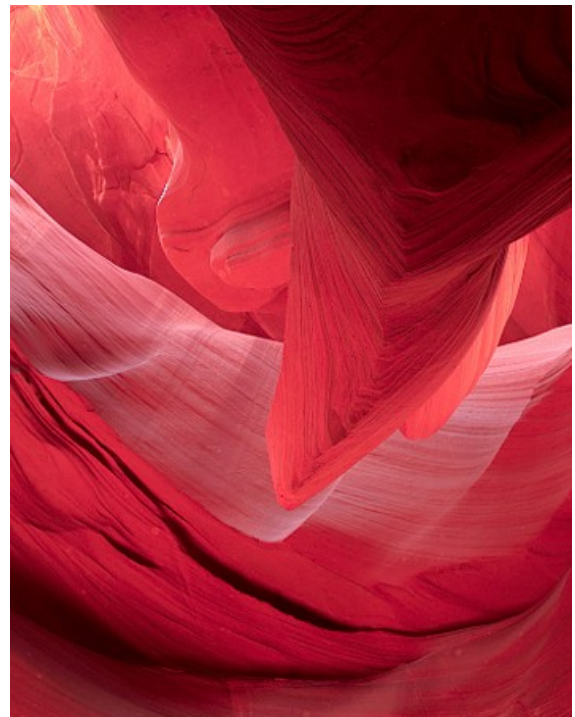
Lower Antelope Canyon Ebony SV45te 4 seconds F32150mm no filtration

From Moab we moved down to Monument Valley and our hosts the Navajo - the landscape there is simply awesome. Our trip to the prohibited parts of the valley with a Navajo guide was great fun, truly this is Cowboys and Injuns country.